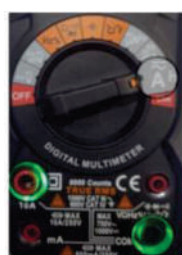
INPUT JACK LED INDICATOR